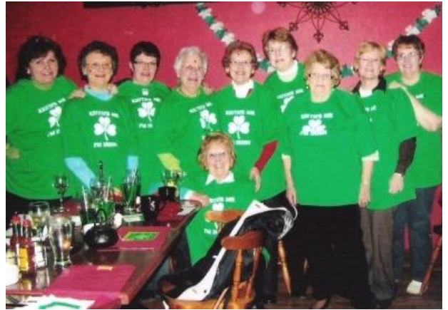
St. Patrick's Night at the Pub (Truro Alumnae Newcomers Club)

The Newcomers Club is holding their closing dinner in early June, and I plan to attend.